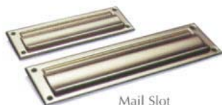
Mail Slot Magazine Slot